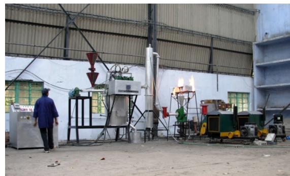
Experimental setup of plastic waste plasma arc pyrolyser